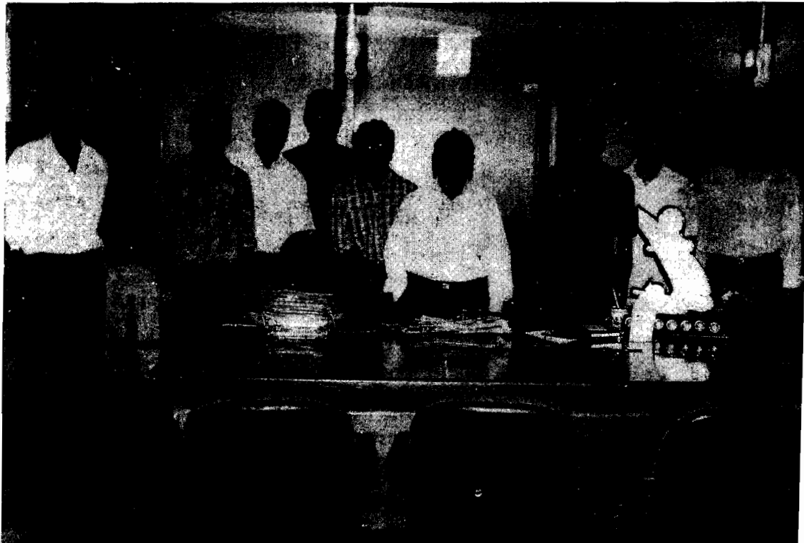
The T.N.E.B. Ball Badminton Team which won the Rajiv Gandhi Memorial All India Senior Invitation Ball Badminton Tournament held at Madras from 23—7—94 to 25 - 7—94.